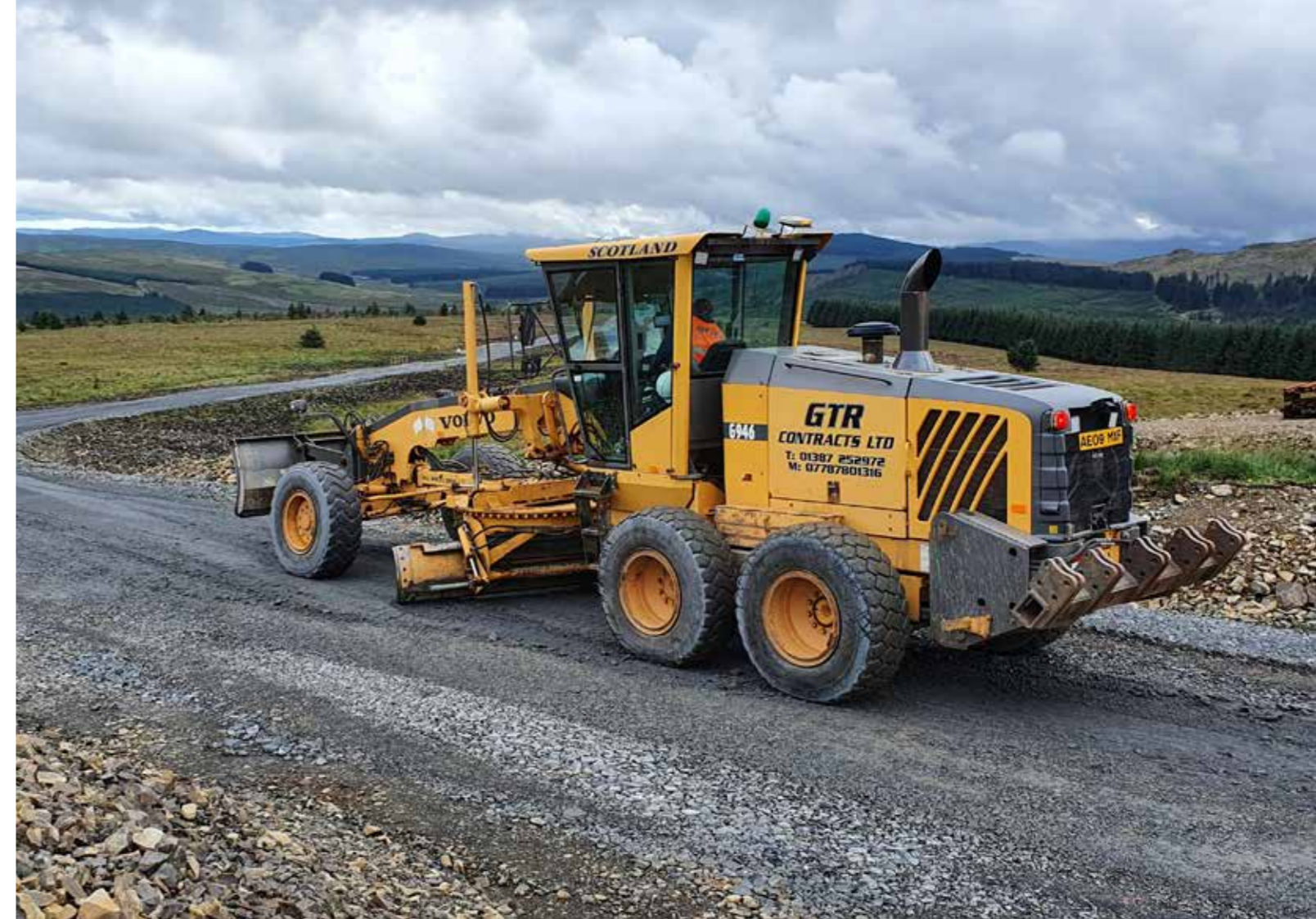
Twentyshillling Hill Wind Farm, near Sanquhar.